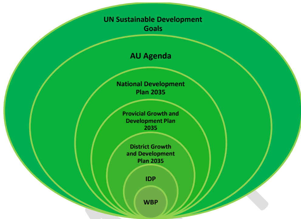
Figure 2: Structure of Alignment

The cross-border alignment with bordering municipalities' i.e uMfolozi, Mhlathuze, Mthonjaneni, Nkandla and Mandeni Municipality should be strengthened as and when necessary.