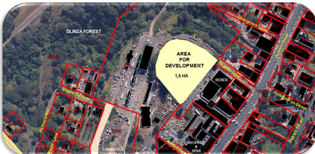
Figure 1 Study area

The site/area for Development is located along theatre lane at the Central Business District of eShowe Town. It is surrounded by various Land uses including the Taxi Rank, Shops and Dlinza Forest.